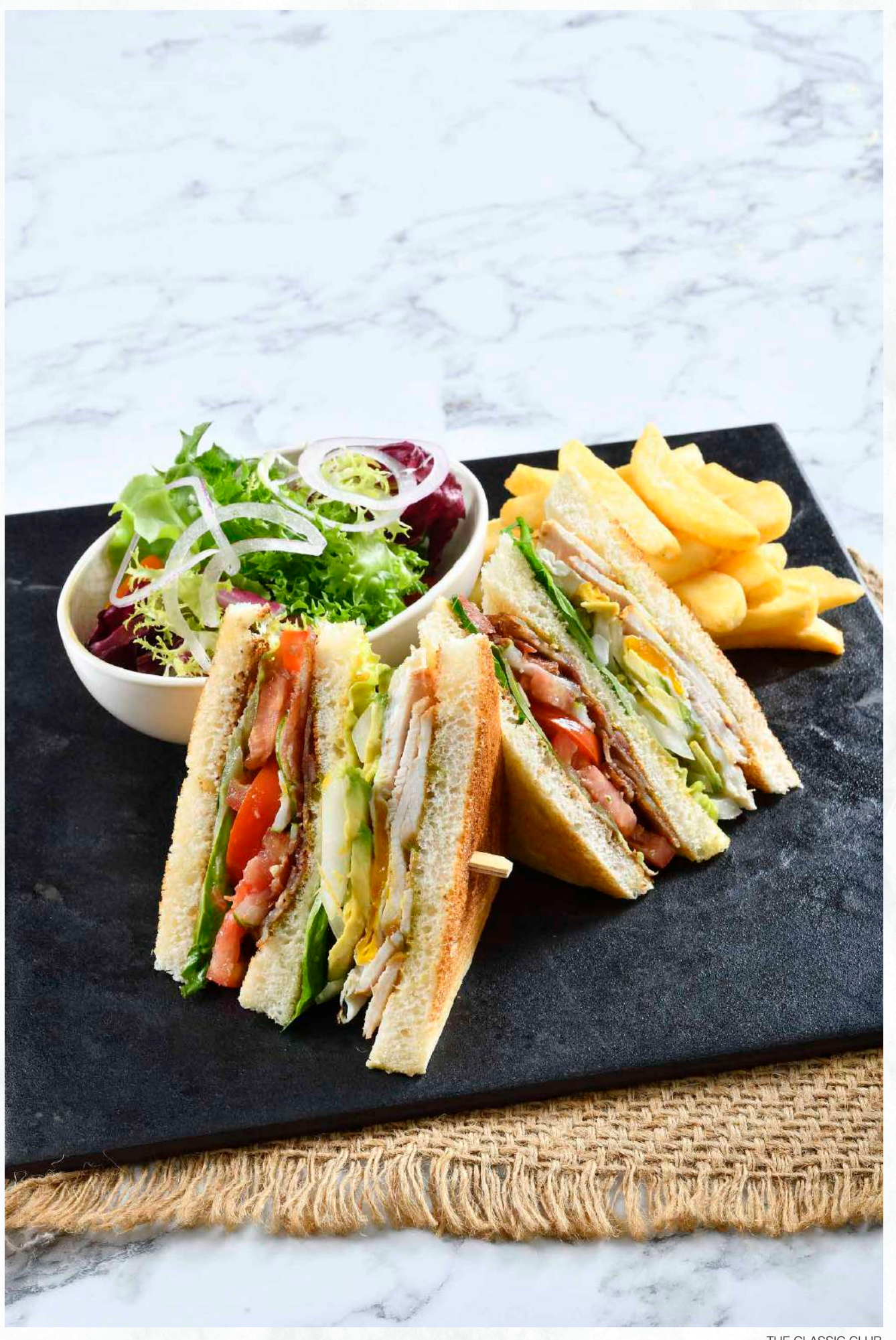
THE CLASSIC CLUB