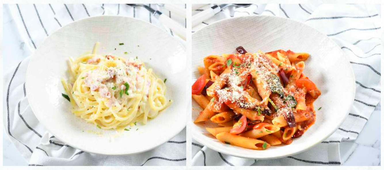
CARBONARA SPICY ARRABIATA