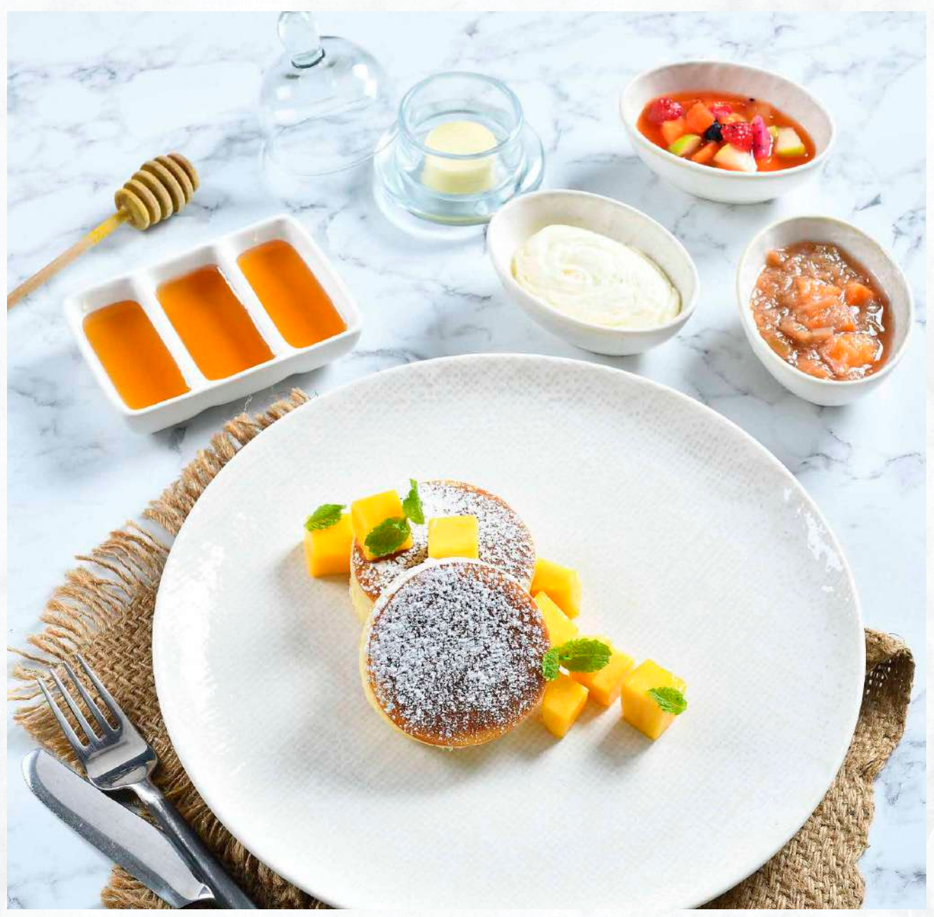
PANCAKES, BELGUIM STYLE WAFFLES OR FRENCH TOAST "PAIN PERDU"